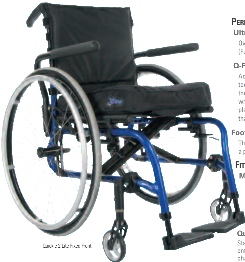
Quickie 2 Lite Fixed Front

Our design teams thoroughly analyze the market and begin the design process by recognizing and responding to user needs. In development, we consider how the body interacts with the chair and how the two can work as one to maintain maximum efficiency, performance, style and fit for every user. At Quickie, the product undergoes rigorous testing in addition to the required testing necessary for federal guidelines. Through our focus on these core elements, we design highly intelligent wheelchairs that confidently receive the users' stamp of approval.