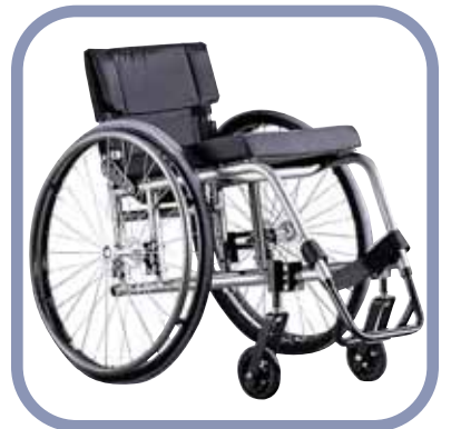
Quickie GPV Ti