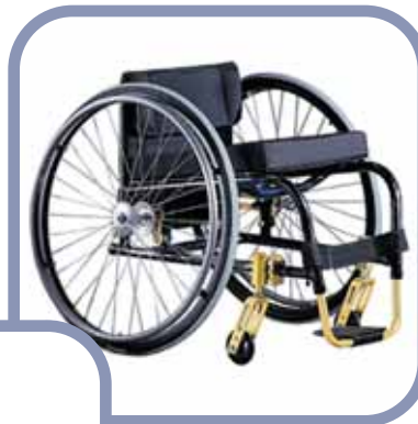
Quickie GPV Comp