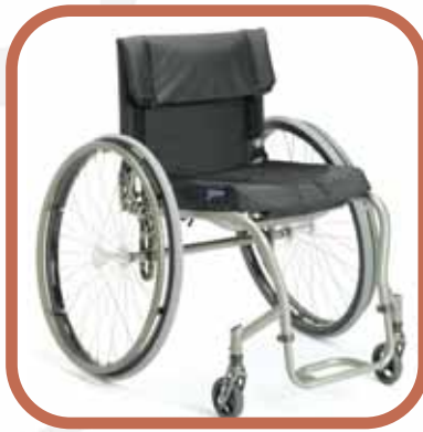
Quickie Ti Titanium