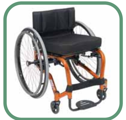
Quickie R2 Rigid