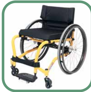
Quickie R2 Adjustable