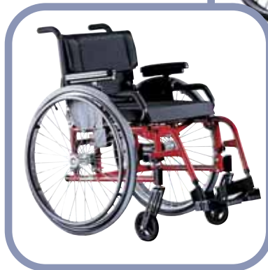
Quickie GP SA