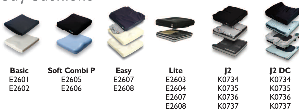
Basic E2601 E2602