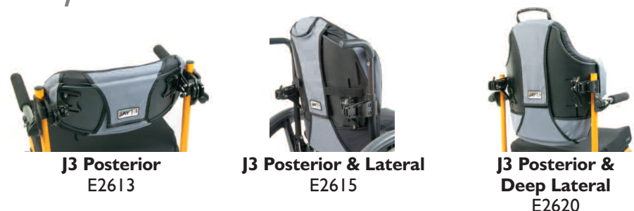
J3 Posterior E2613