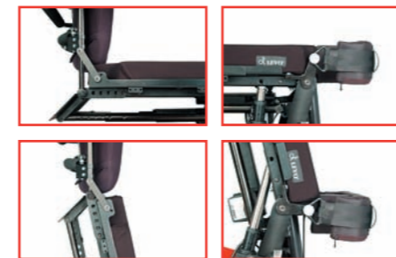
Back and knee adjustment to reduce shear

stop anywhere in between. In any position you can engage the world with power mobility – move, turn, reverse – all while in any of the multiple and customised seating positions that you choose for your chair. The LEVO combi easily manoeuvres within your home, your work. Indoors, outdoors, all while ensuring stability, safety, multiple seating and standing positions to enhance and extend quality of life.