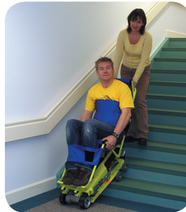
Garaventa Power Evacu-Trac