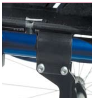
Rear axle with infinite rear wheel centre of gravity adjustment for optimum driving and turning performance