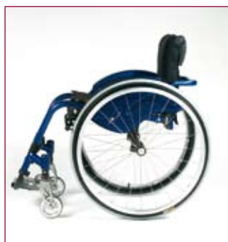
True open frame design

High tolerances and rigidity for excellent handling, rolling performance and cornering. Rigid frame construction and excellent driving characteristics. Minimalist open frame design ensures easy lifting and transportation.