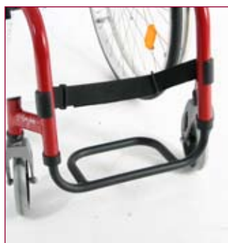
Lightweight tubular footrest (option)

and a custom choice to hit the road. A wide range of options, six different upholstery colours and 20 brilliant and matt finishes for your frame, hubs, forks, wheels, handrims and footplates.