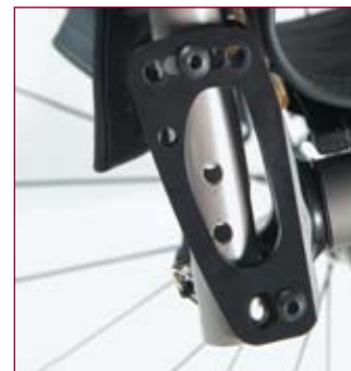
Improved, durable folding backrest system offering angle adjustment from -12^{\circ} to +8^{\circ}