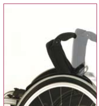
Fold down backrest with "double lock" (option) holds the backrest down for easy transportation