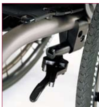
Compact wheel lock folds away nicely below the frame (option)