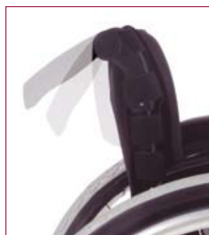
Fold down push handles (option)