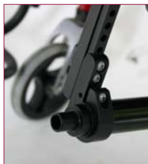
Lightweight axle plate and axle tube clamp offers independent adjustments of seat height and axle spacing