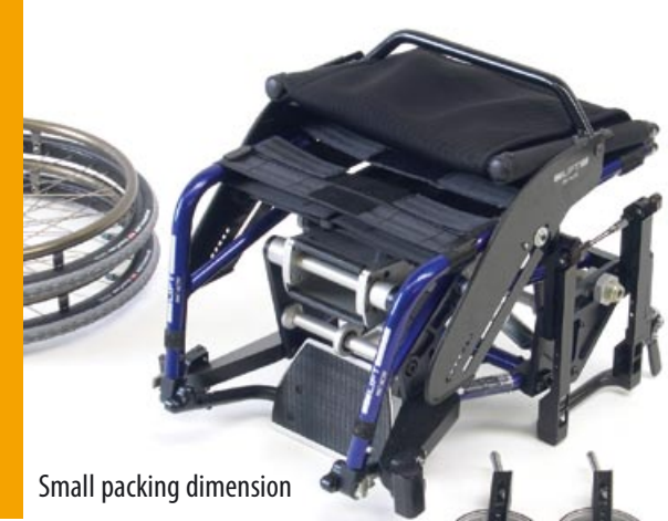
Small packing dimension