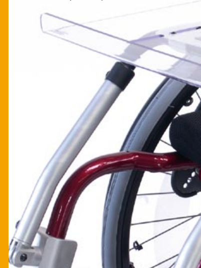
Table – easy and quick to attach