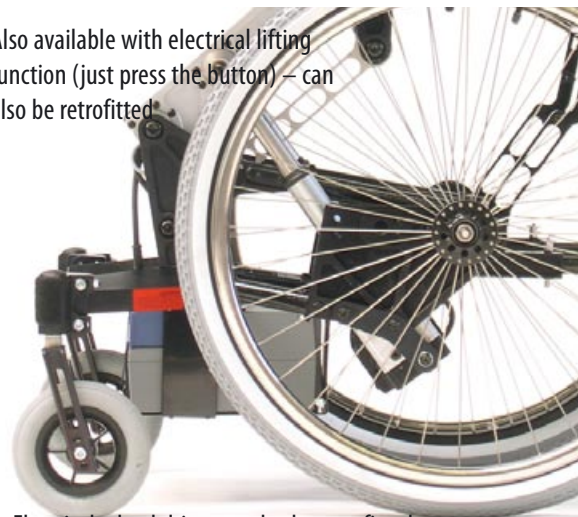
< Electrical wheel drive can also be retrofitted