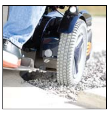
ESP (Enhanced Steering Performance) virtually eliminates the need for constant manual correction when driving on uneven ground, soft surfaces, angled and sloped areas or at high speeds.