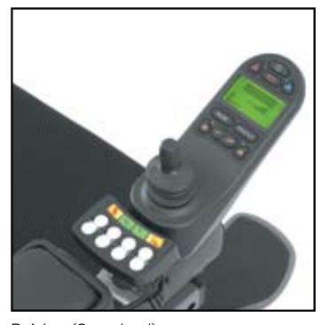
R-Net (Standard). Alternative Drive Controls available. (Option)