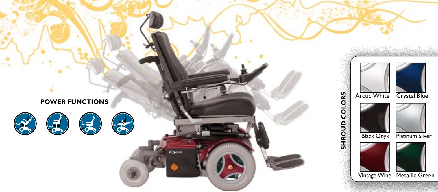
Power adjustable tilt, seat height, legrests and recline.