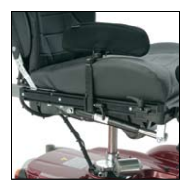
UniTrack: Complete and flexible support system. (Option)