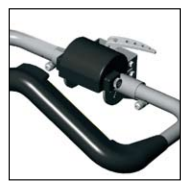
Co-pilot: Easy to use, power assisted attendant control. (Option)