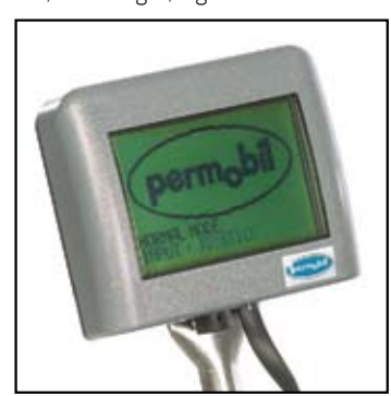
Magic Drive: Opens up a world of alternative control possibilites. (Option)