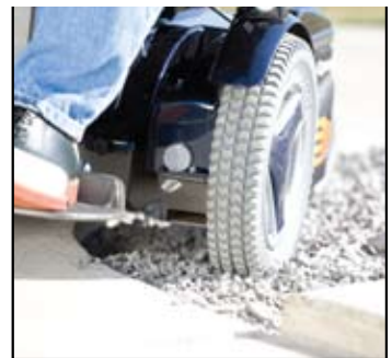
ESP (Enhanced Steering Performance) virtually eliminates the need for constant manual correction when driving on uneven ground, soft surfaces, angled and sloped areas or at high speeds.