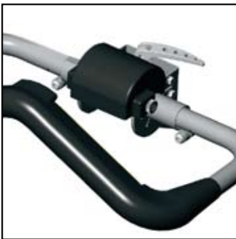
Co-pilot: Easy to use, power assisted attendant control. (Option)

Power adjustable tilt, seat height, legrests and recline.