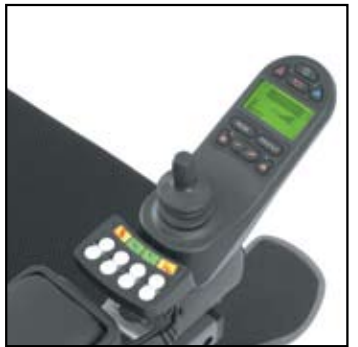
R-Net (Standard). Alternative Drive Controls available. (Option)