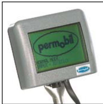
Magic Drive: Opens up a world of alternative control possibilities. (Option)