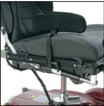
UniTrack: Complete and flexible support system. (Option)