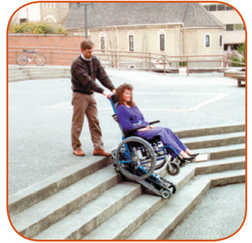
Attach the Stair-Trac to the wheelchair, recline the passenger and move them to the stairway.