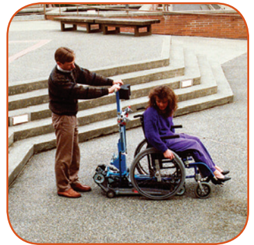
Ascend or descend stairs with the press of a button. The passenger sits in a comfortable, upright position.