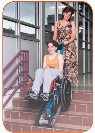
Stair-Trac will climb virtually any stair tread material.